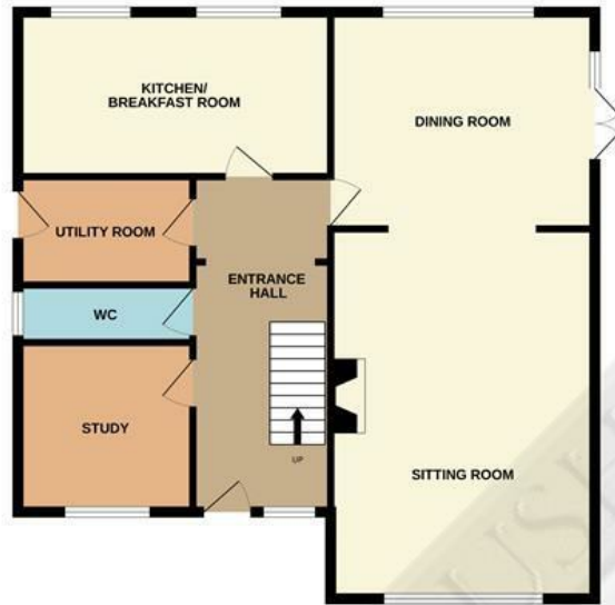
1ST FLOOR 886 sq.ft. (82.3 sq.m.) approx.